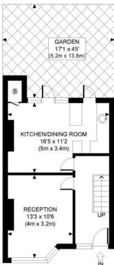
GROUND FLOOR GROSS INTERNAL FLOOR AREA 395 SQ FT