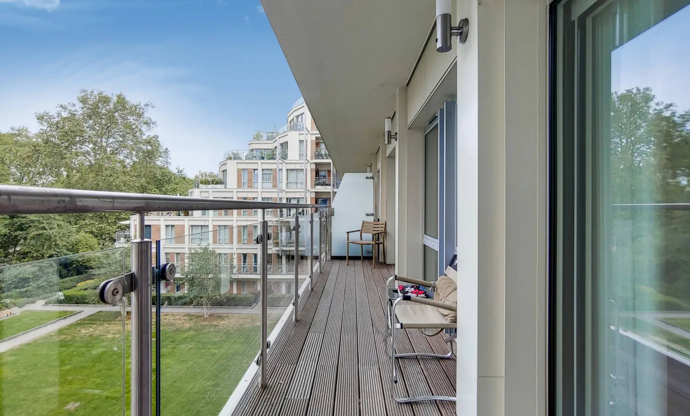
Flat 61, Admiralty Building, 17 Henry Macaulay Avenue £750,000