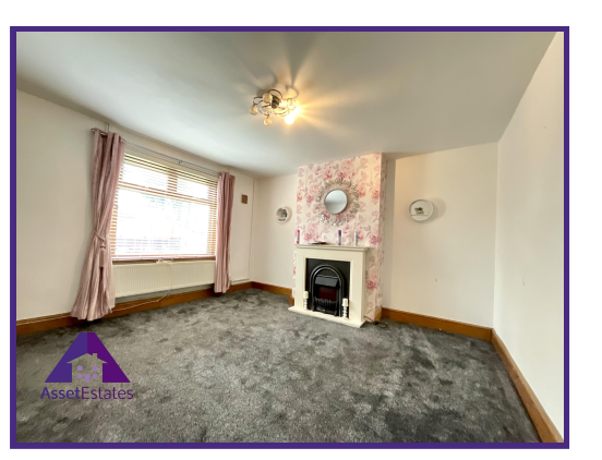
Glanffrwd Avenue, Ebbw Vale, NP23 6HE