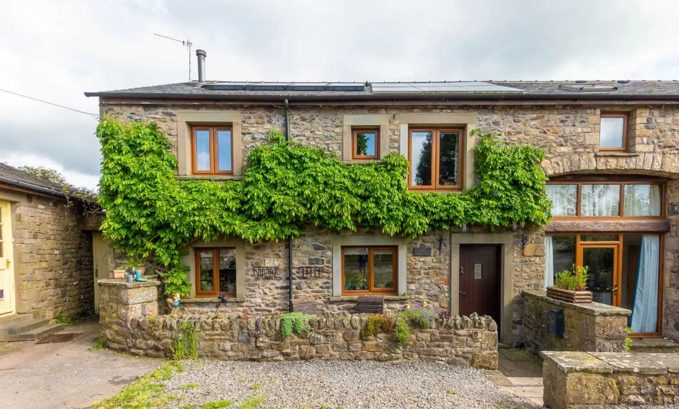
Collingholme Barn Cottage, Cowan Bridge £630,000 Freehold