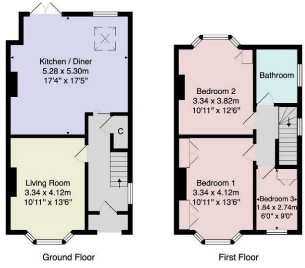
Total Area: 85.7 m² ... 922 ft² All measurements are approximate and for display purposes only. No liability is accepted by either the agency or Box Property Solutions Ltd as to the exact measurements of the rooms. Box Property Solutions Ltd retains the copyright on this plan and allows agents to use it with agreed permission.