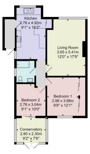
Total Area: 73.6 m² ... 792 ft² All measurements are approximate and for display purposes only. No liability is accepted by either the agency or Box Property Solutions Ltd as to the exact measurements of the rooms. Box Property Solutions Ltd retains the copyright on this plan and allows agents to use it with agreed permission.