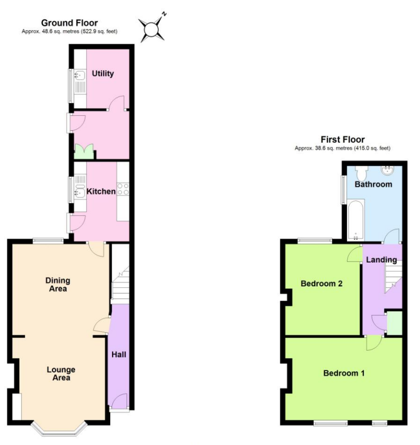
Total area: approx. 87.1 sq. metres (937.9 sq. feet)