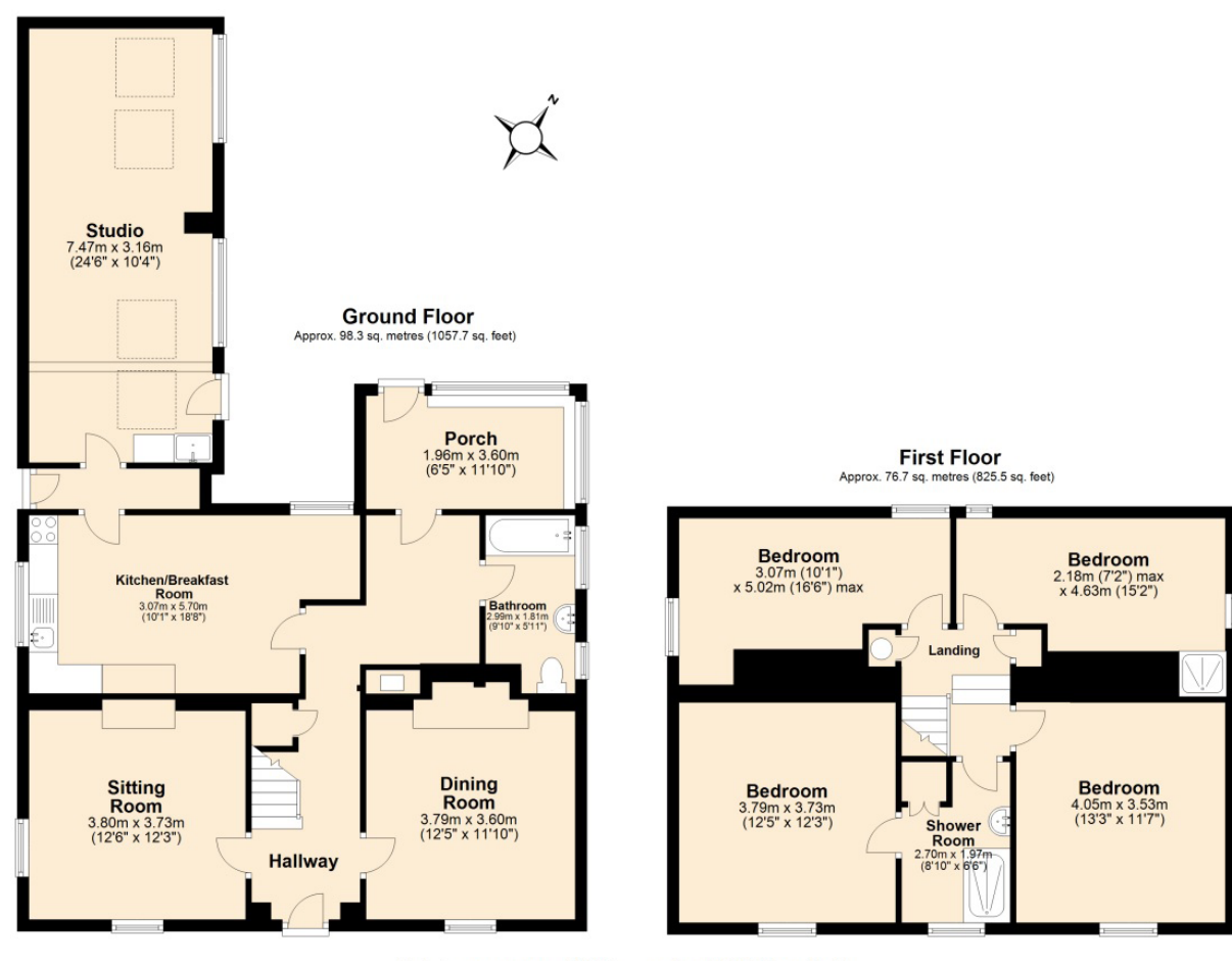
Total area: approx. 175.0 sq. metres (1883.2 sq. feet)