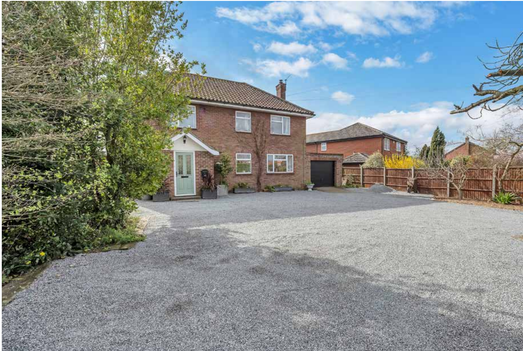
'Wonderful Home, Close to Town' Diss, Norfolk | IP22 4PB