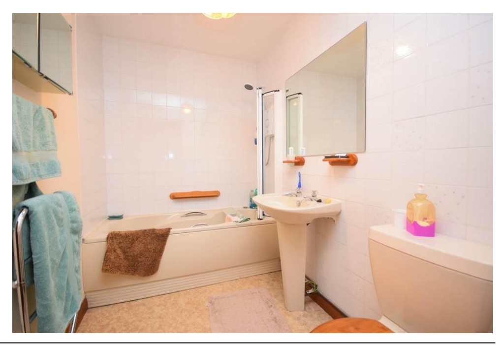
Next Home - 4 Manse Court, Kirk Wynd, Blairgowrie, PH10 6HN