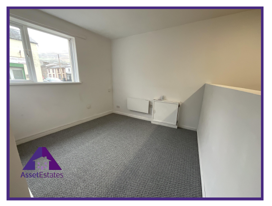
High Street, Blaina