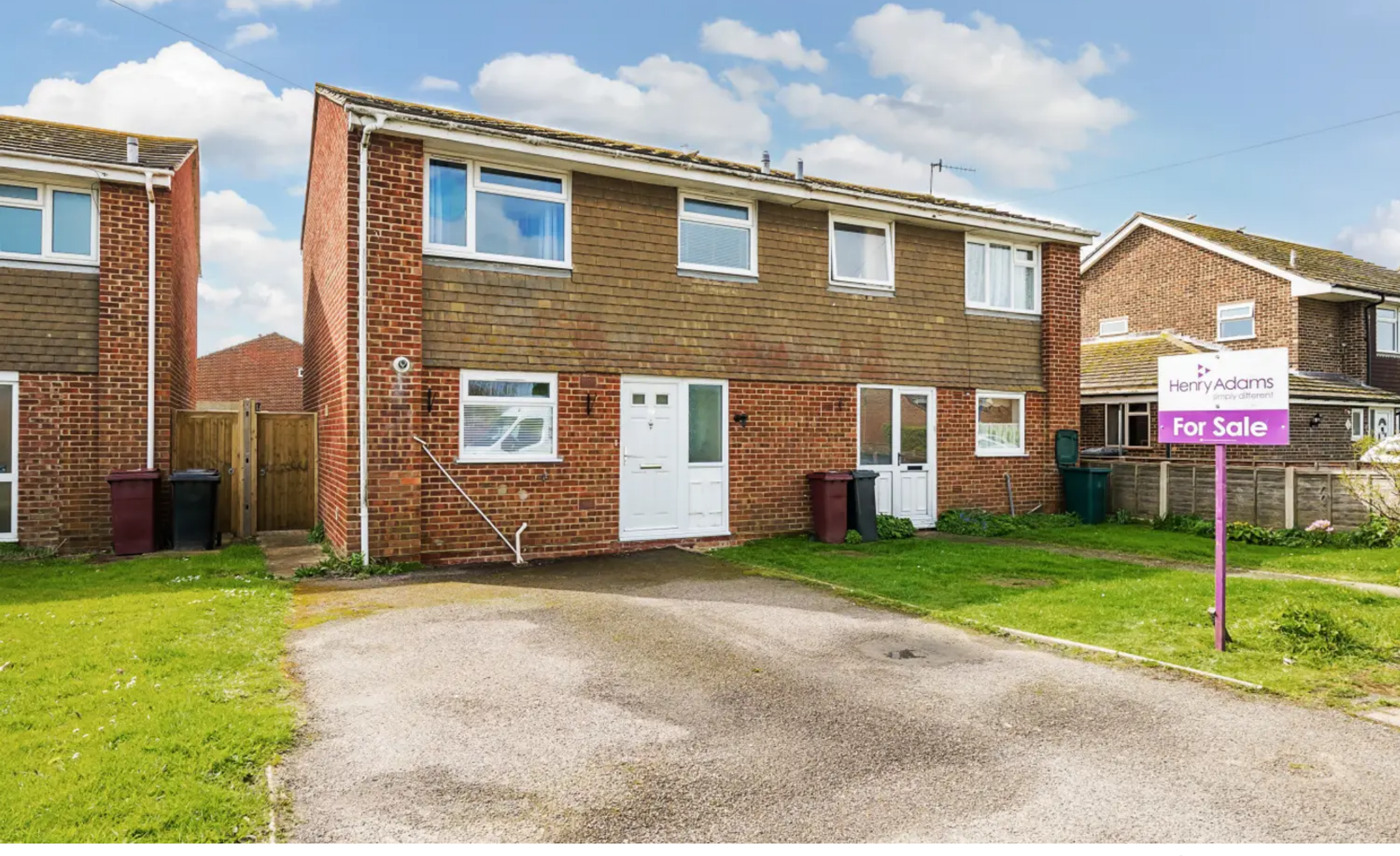
19 Lingfield Way, Selsey Guide Price £299,950 Freehold