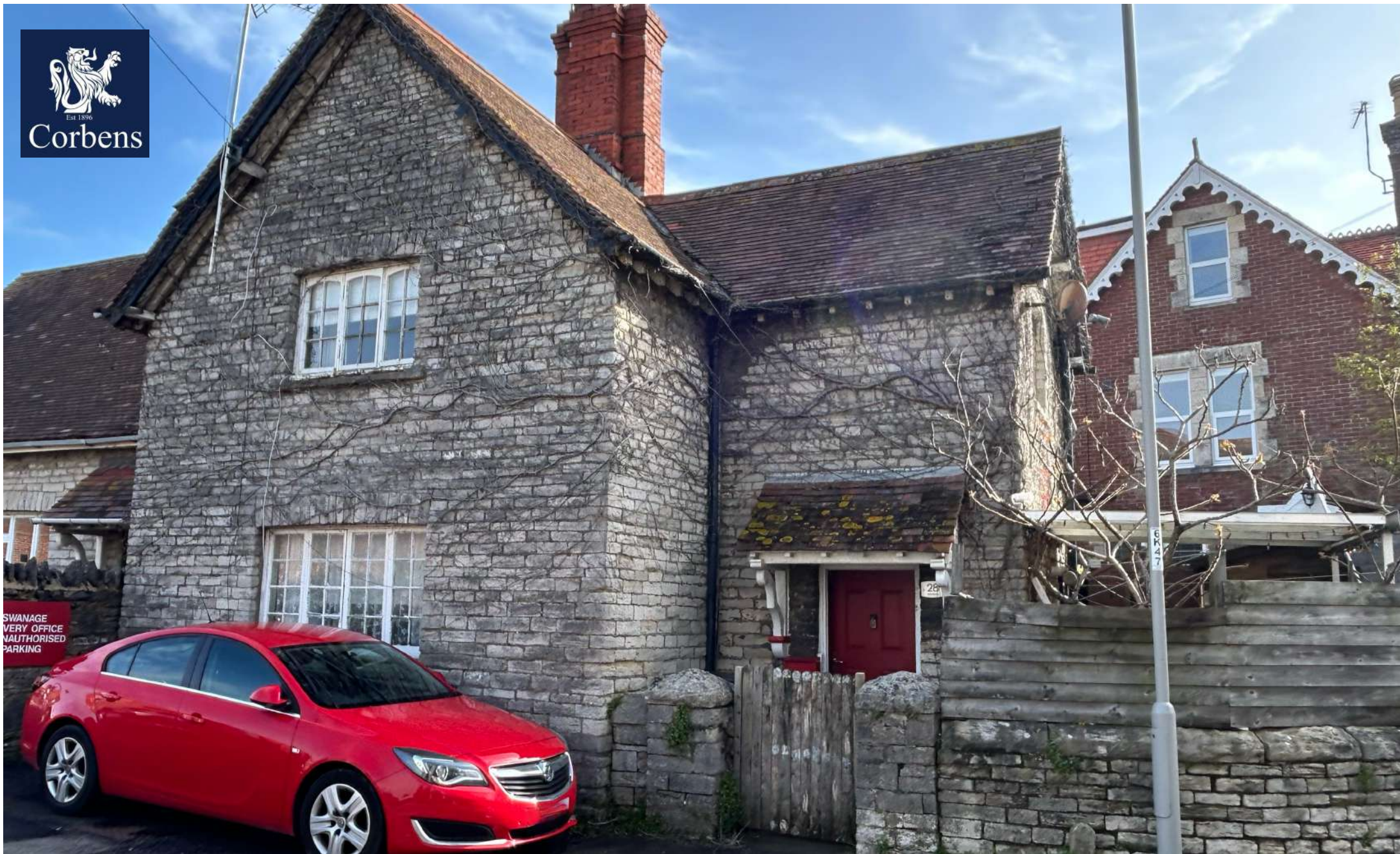
28 KINGS ROAD EAST, SWANAGE £365,000