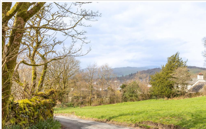
View from Lickbarrow Close