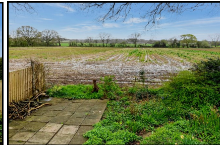
Pitch Fee: approx £tbc per month Subject to Annual Review Council Tax Band: 'A' Tenu