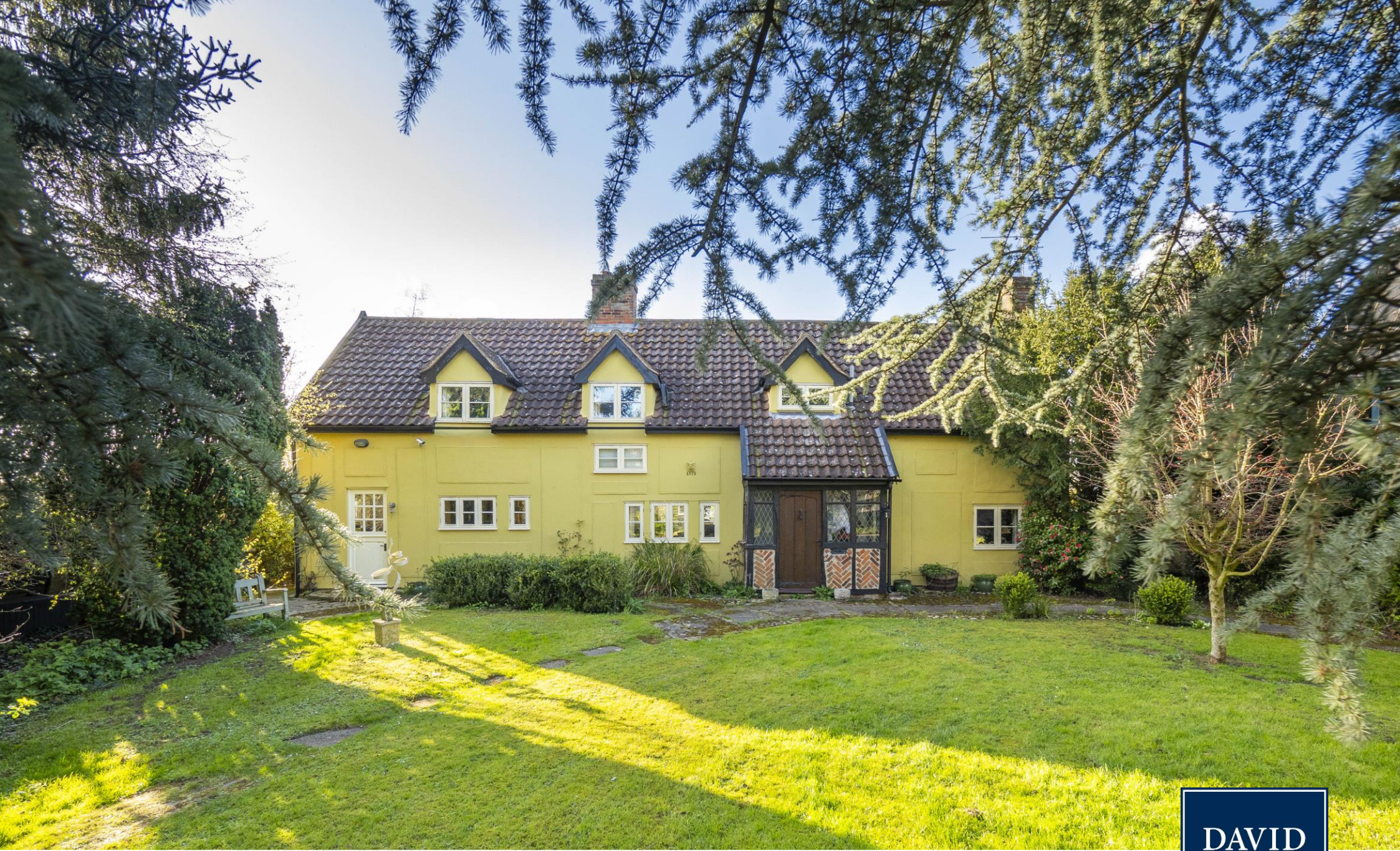
Paddock Cottage Battisford, Suffolk