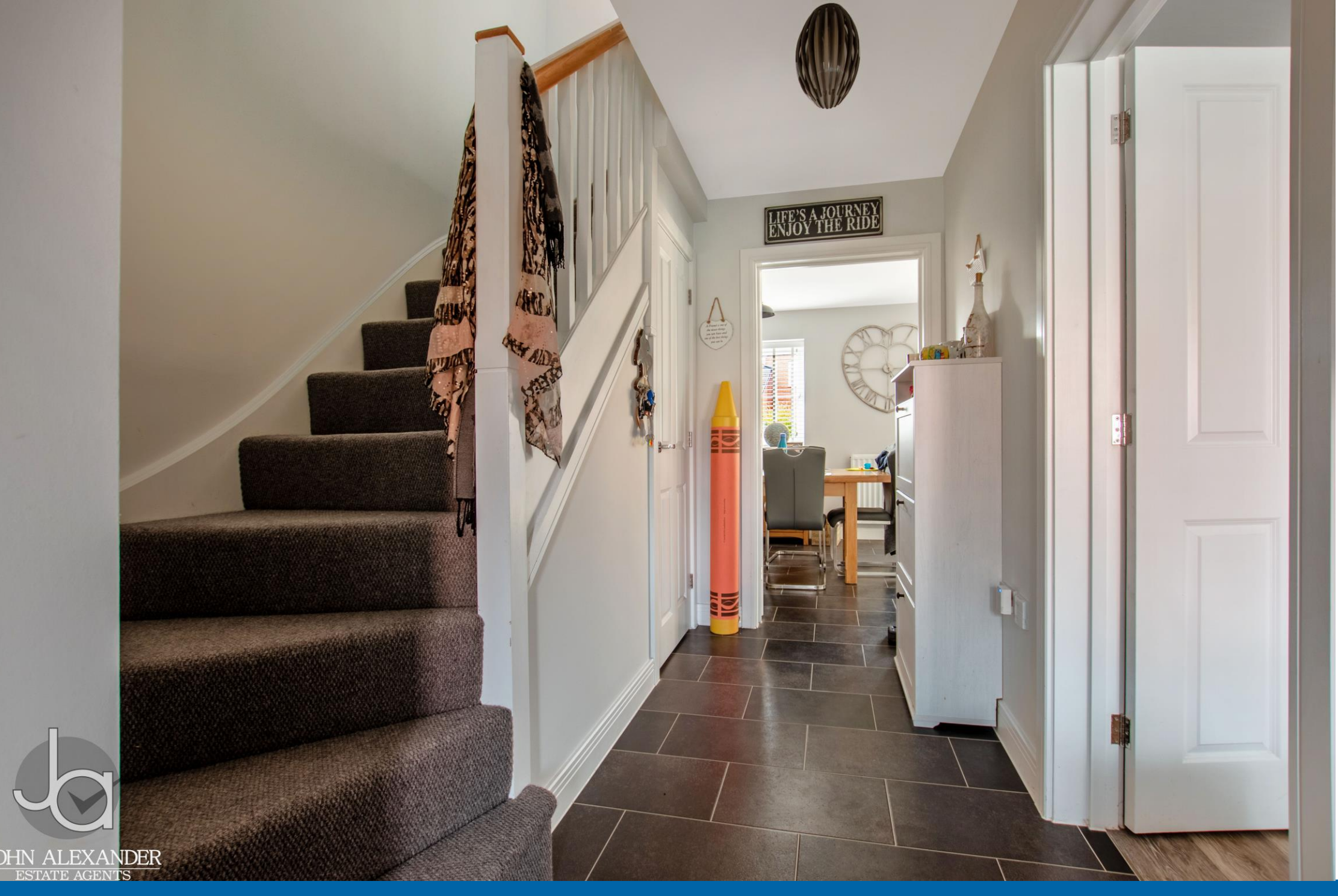
Murray Mcpherson Parade, Colchester, CO4 9AH