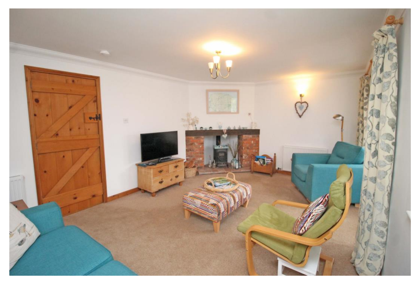
3 Caston Close, Holt, Norfolk NR25 6PD