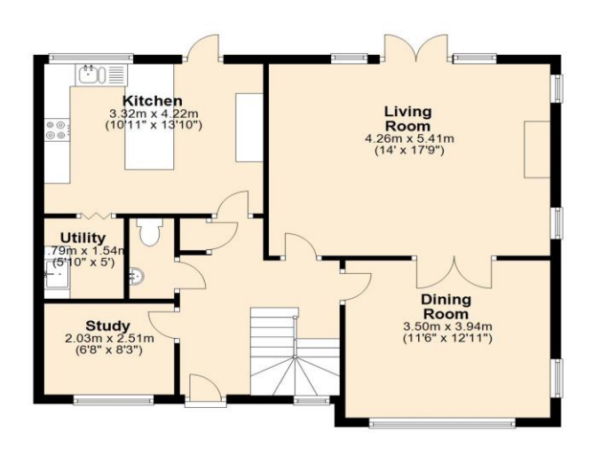
First Floor Approx. 73.6 sq. metres (792.2 sq. feet)