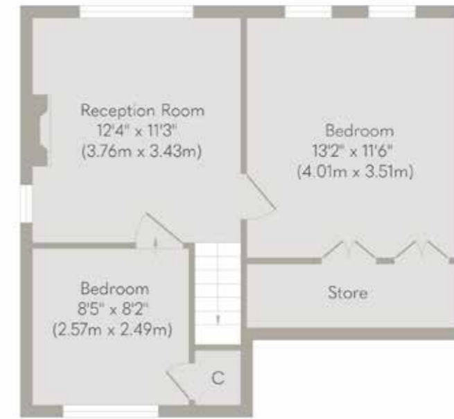
First Floor Approximate Floor Area 442 sq. ft (41.09 sq. m)