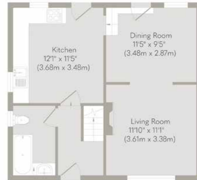
Ground Floor Approximate Floor Area 492 sq. ft (45.73 sq. m)

Whilst every attempt has been made to ensure the accuracy of the floor plan contained here, measurements of doors, windows, rooms and any other items are approximate and no responsibility is taken for any error, omission, or mis-statement. This plan is for illustrative purposes only and should be used as such by any prospective purchaser or tenant. The services, systems and appliances shown have not been tested and no guarantee as to their operability or efficiency can be given.