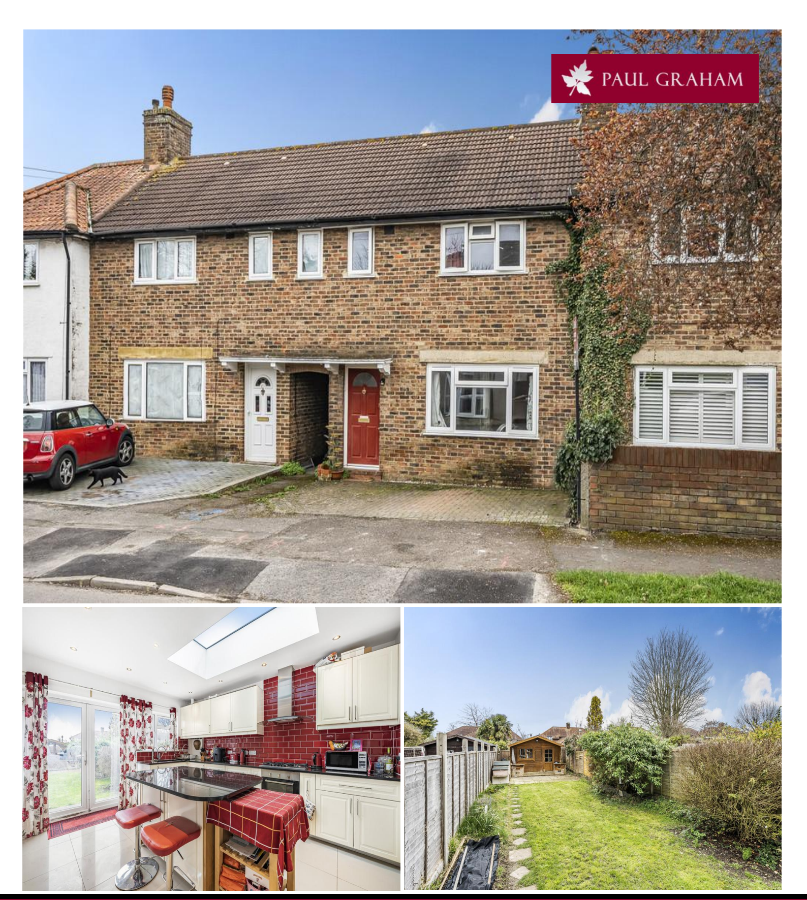
7 Courtney Crescent, Carshalton, SM5 4NA | Guide Price £500,000 Freehold

Nestled in the heart of the desirable Carshalton on the Hill, this impressive 3 bedroom terraced house offers a perfect blend of modern living and traditional charm. Step inside to discover a spacious and light-filled interior, enhanced by a thoughtfully designed rear extension. This extension has created a stunning open-plan kitchen and dining area, perfect for hosting. Adjacent to the kitchen, you'll find a study/office. There is a secluded rear garden complete with a charming summer house. Of further benefit is off road parking.