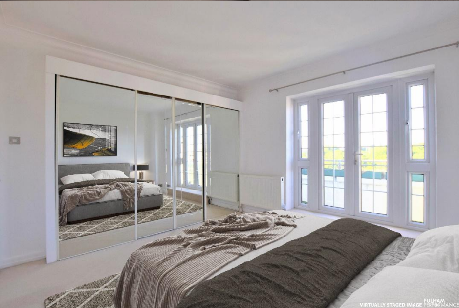
VIRTUALLY STAGED IMAGE FULHAM PERFORMANCE