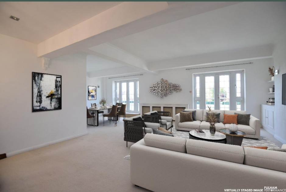
VIRTUALLY STAGED IMAGE FULHAM PERFORMANCE