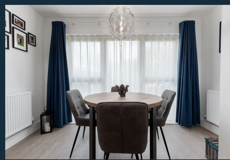
Flat 10, Green Side Views, 38 Mill Green Road £260,000 Leasehold