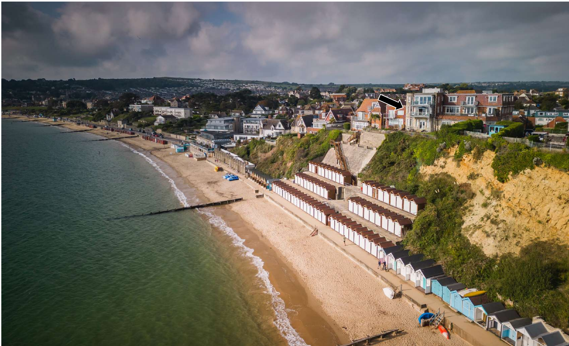
APARTMENT 6 HIGHCLIFFE, 4 HIGHCLIFFE ROAD, SWANAGE £875,000 Leasehold