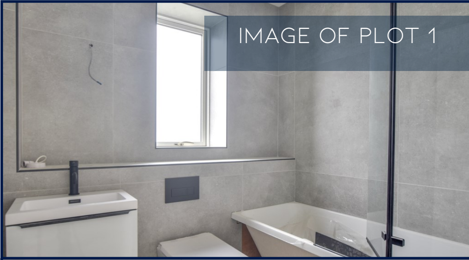
IMAGE OF PLOT 1