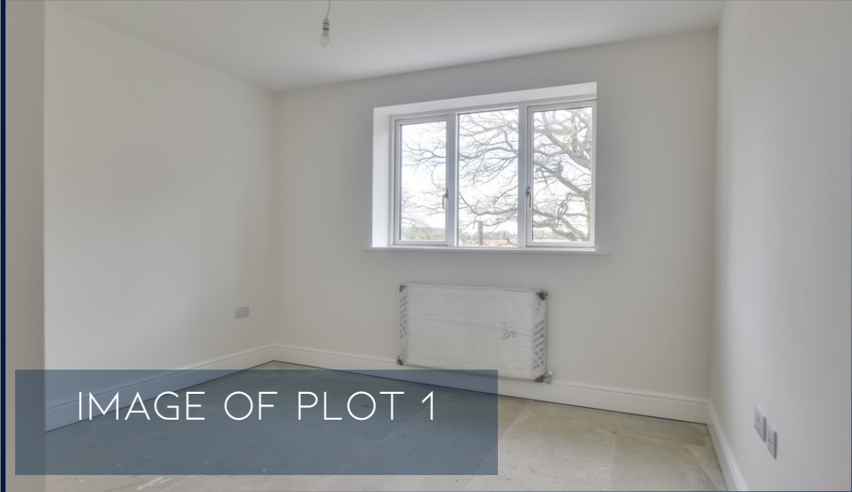
IMAGE OF PLOT 1