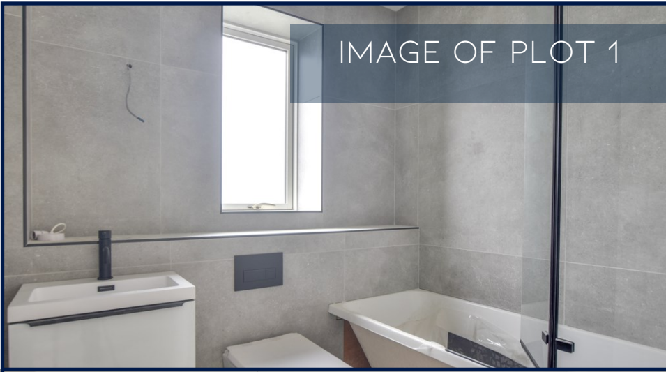
IMAGE OF PLOT 1