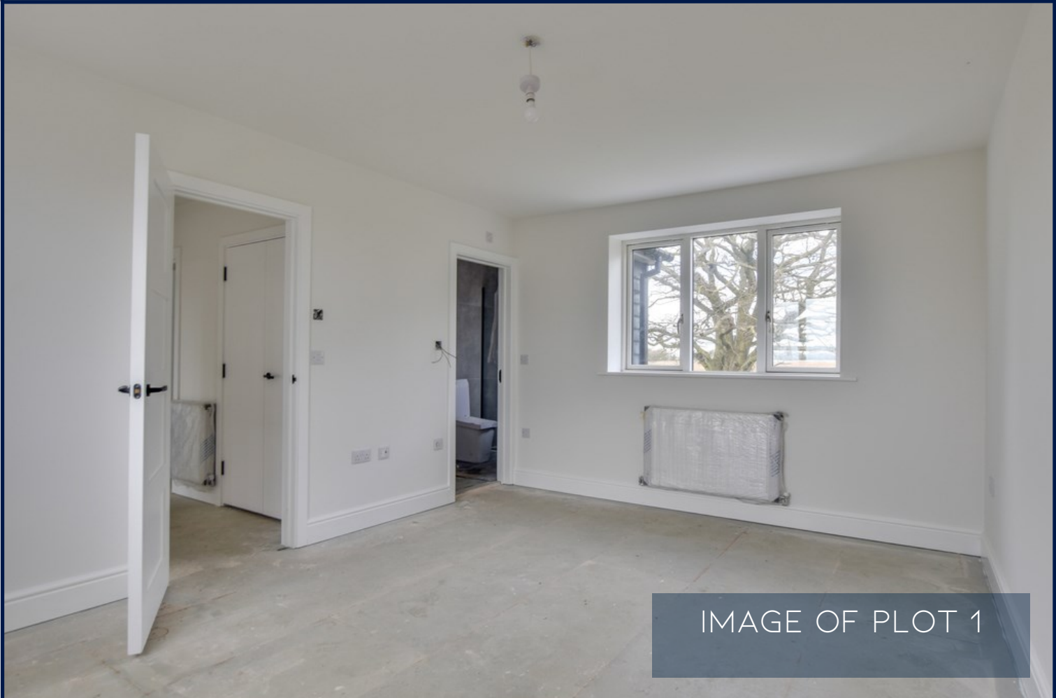
IMAGE OF PLOT 1