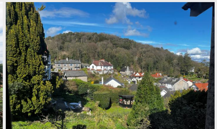
View towards Eggerslack Woods