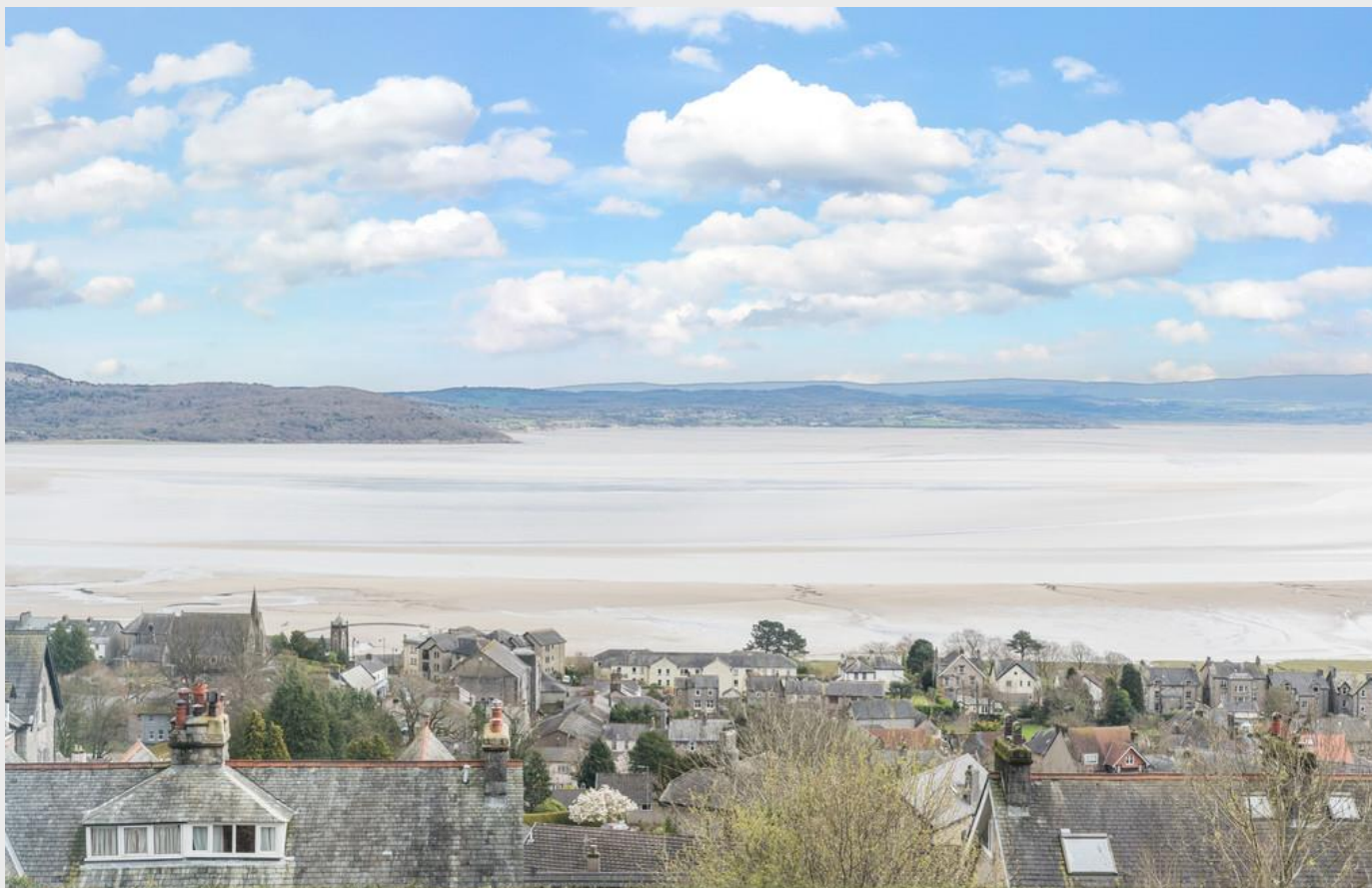
Views to Morecambe Bay