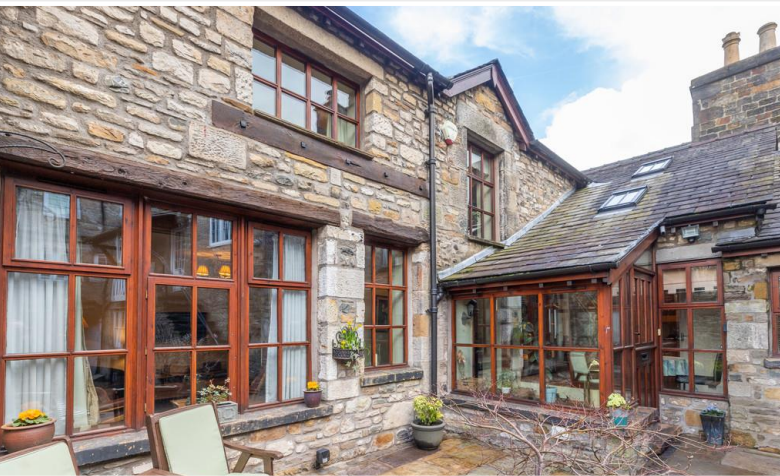
The Old Coach House