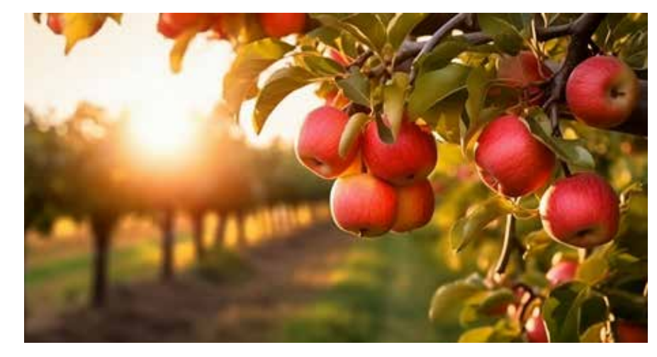
The Walled Garden was originally created to provide year round produce for the occupants of Burnham Westgate Hall.

"...the garden will not only pay homage to its historical significance, but at the same time will provide a practical and aesthetic use of this wonderful open space."