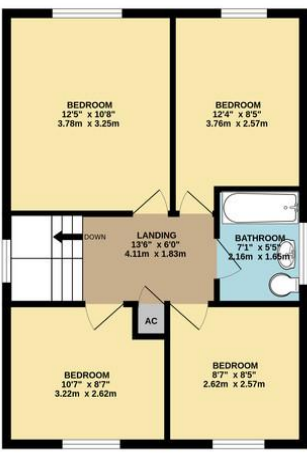
TOTAL FLOOR AREA: 1113 sq.ft. (103.4 sq.m.) approx.

Whits twey uttering has been made to ensure the accuracy of the floorpian contained here, measurements of doncy, windows, comes and any other tensu are approximate and no responsibility of steller of any error, omission or mis-statement. This plan is for illustrative purposes only and should be used as such by any prospective purchaser. The services, systems and appliances shown have nobeen tested and no guarantee as to their operability or efficiency can be given. As to their operability or efficiency can be given.