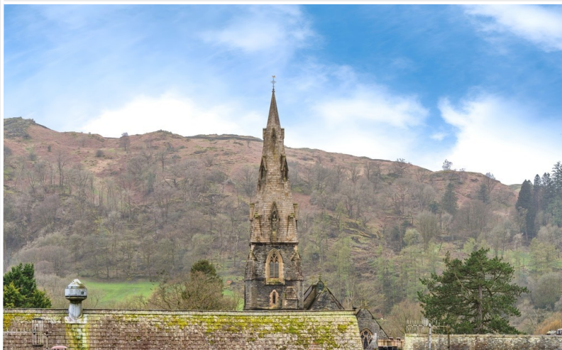
Fell View and St Marys Church from Property