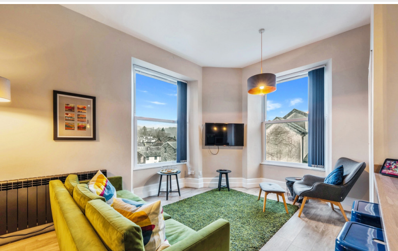
Dual Aspect Lounge Area

A superb investment opportunity and one certainly not to be missed.