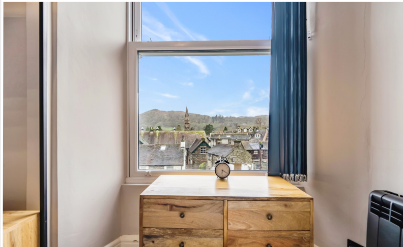
Bedroom with Views