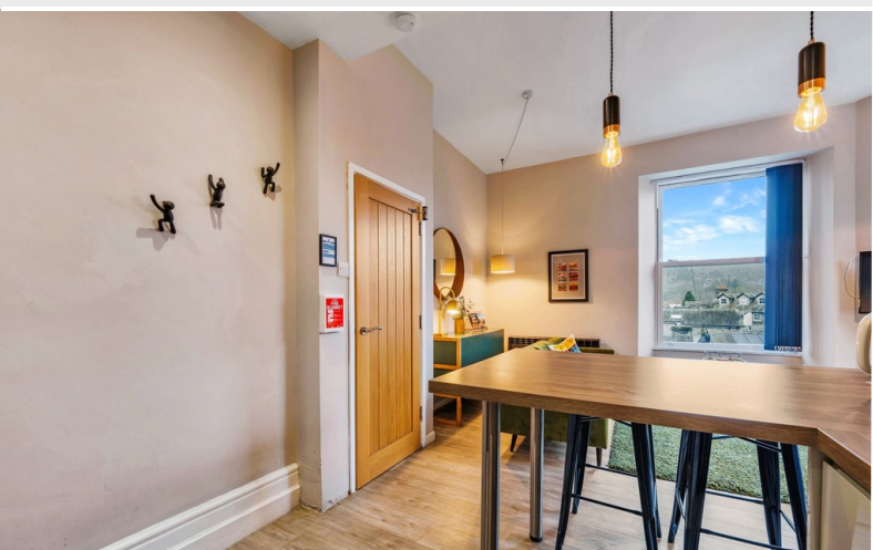
Informal Dining Area