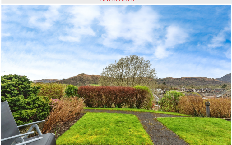
View from Patio