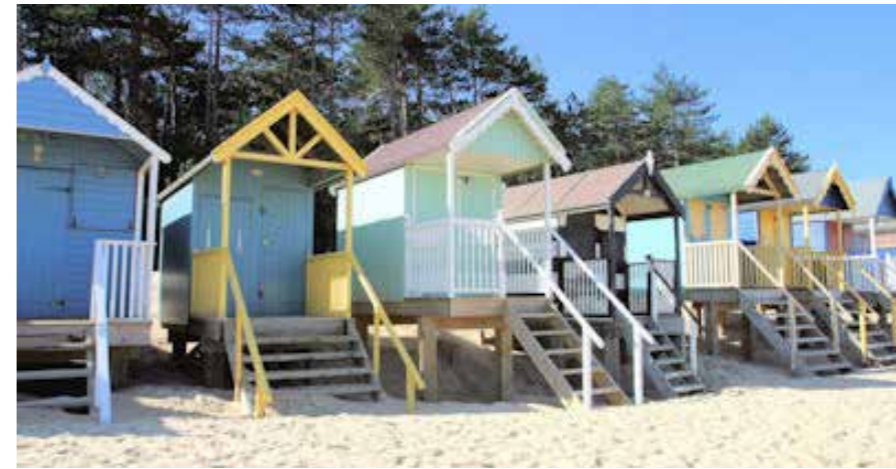
Wells-next-the-Sea Beach Huts

“Locally I like to visit Wells and explore the woods.”