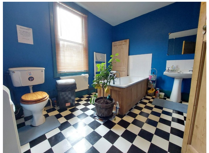
10' 4'' x 10' 5'' (3.15m x 3.18m) Panelled bath. Low level flush WC: Wash hand basin. Double panelled radiator. Towel radiator. Wooden sash window to front elevation.

11' 4'' x 13' 2'' (3.45m x 4.01m)Wooden sash window to rear elevation.Period fireplace. Single panelled radiator.