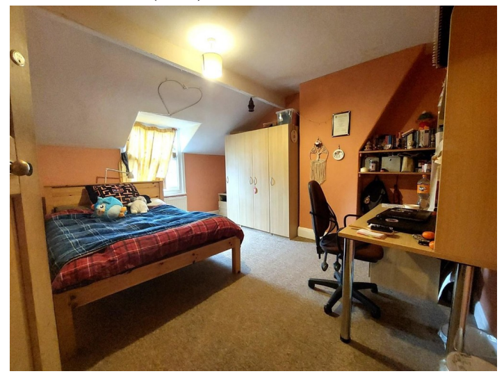
12' 3'' x 13' 7'' (3.73m x 4.14m) Dormer sash window to rear. Double panelled radiator.