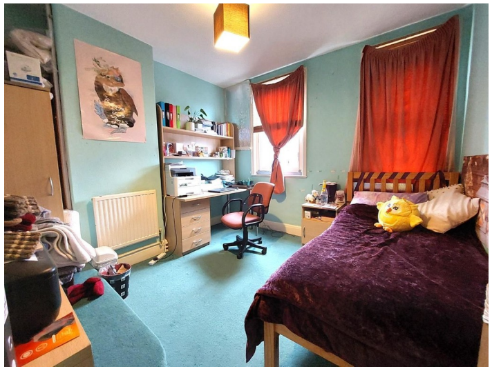
BEDROOM 3 (rear)