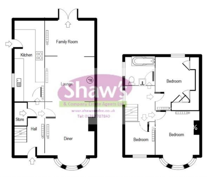
Whilst every attempt has been made to ensure the accuracy of the floor plan contained here, measurements of doors, windows, rooms and any other items are approximate and no responsibility is taken for any error, omission, or mis-statement and the floor plan is an illustration only as a guide. This plan is for illustrative purposes only and should be used a such by any prospective purchase of rehand! The services, systems, appliances, shown have not been tested and no guarantee as to their operation or efficiency can be given. Made with 1'suad Builder