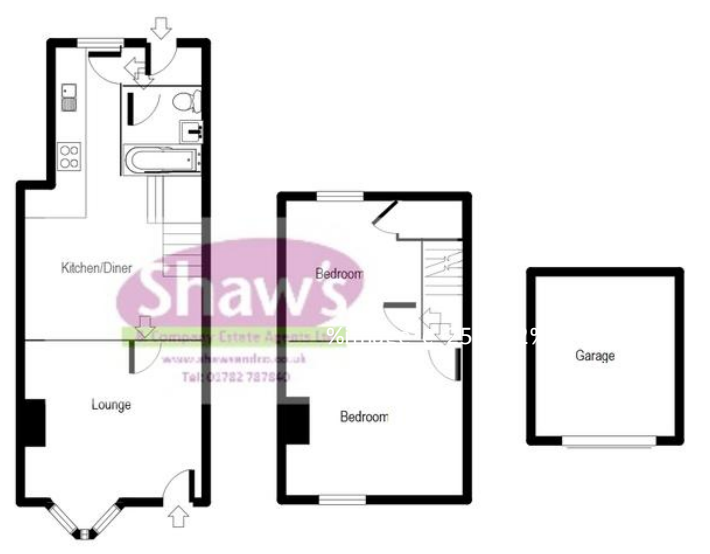
Whilst every attempt has been made to ensure the accuracy of the floor plan contained here, measurements of doors, windows, rooms and any other items are approximate and no responsibility is taken for any error, omission, or mis-statement and the floor plan is an illustration only as a guide. This plan is for illustrative purposes only and should be used as such by any prospective purchaser of lenant. The services, systems, appliances, shown have not been tested and no guarantee as to their operation or efficiency can be given. Made with Young Builder