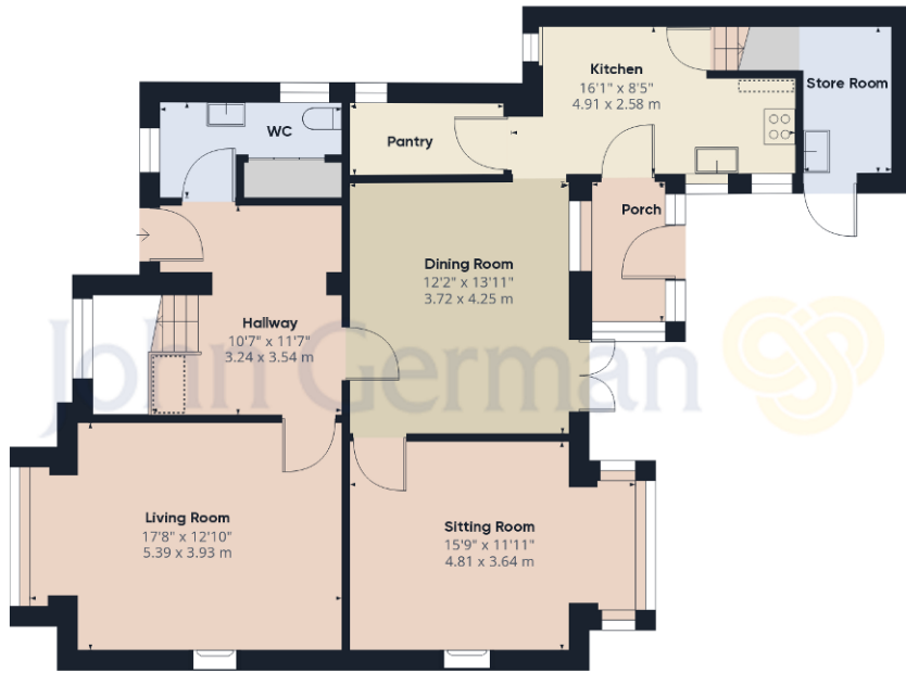
Ground Floor Building 1