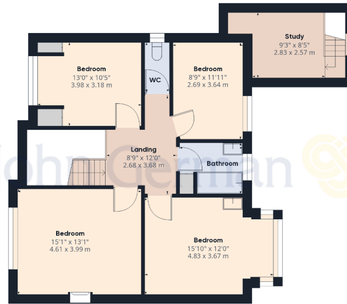
Floor 1 Building 1