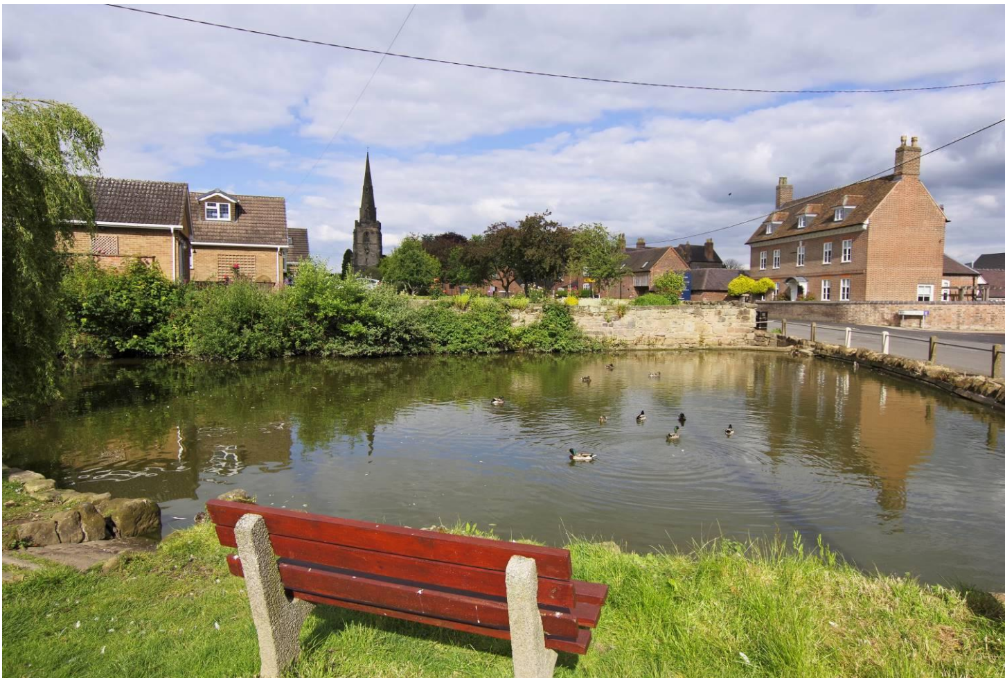
Duck pond in the village