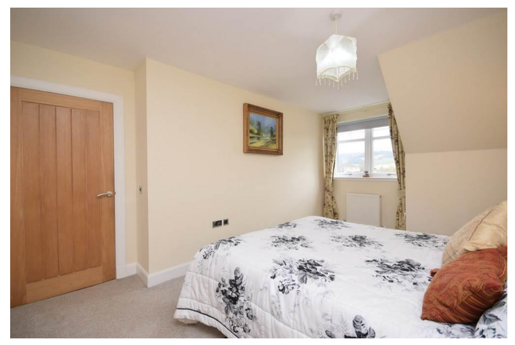
Next Home - Wendyview, West Kinnochtry , Coupar Angus, Blairgowrie, PH13 9PN