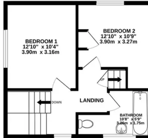
1ST FLOOR 393 sq.ft. (36.5 sq.m.) approx.