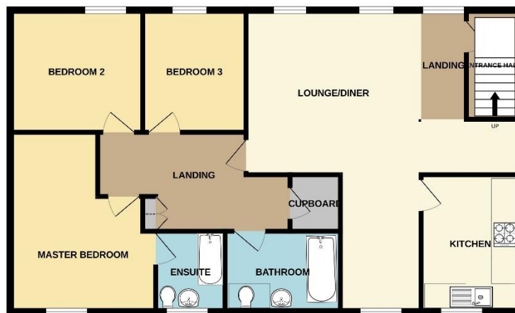
GROUND FLOOR 992 sq.ft. (92.2 sq.m.) approx.

TOTAL FLOOR AREA: 992 sq.ft. (92.2 sq.m.) approx. Whilst every effort has been made to ensure the accuracy of the floorplan contained here, measurements of doors, windows, rooms and any other items are approximate and no responsibility is taken for any error, contradiction or omission. This plan is for illustrative purposes only and should not be relied upon by any prospective purchaser. The services, systems and appliances shown here are not tested and no guarantee is given as to their operability or efficiency on the date. Made with Mettler 12/2021