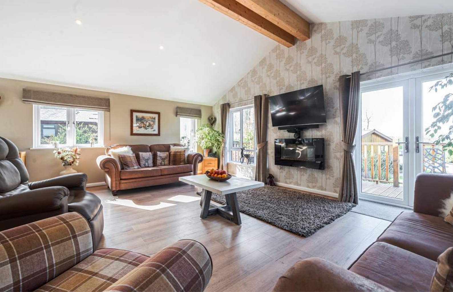
Open plan Living/Dining/Kitchen