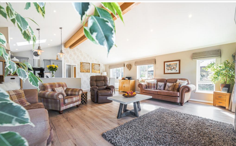
Open plan Living/Dining/Kitchen