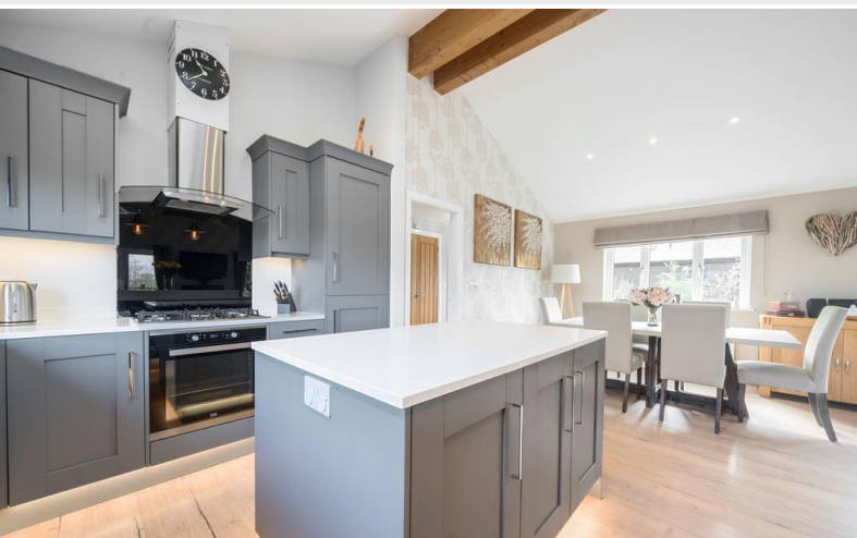
Open plan Living/Dining/Kitchen