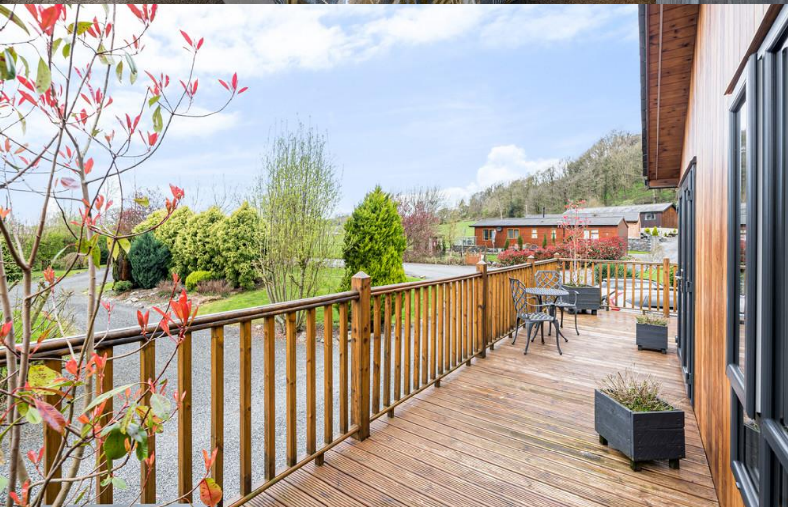
Front Balcony Decking

Request a Viewing Online or Call 015395 32301