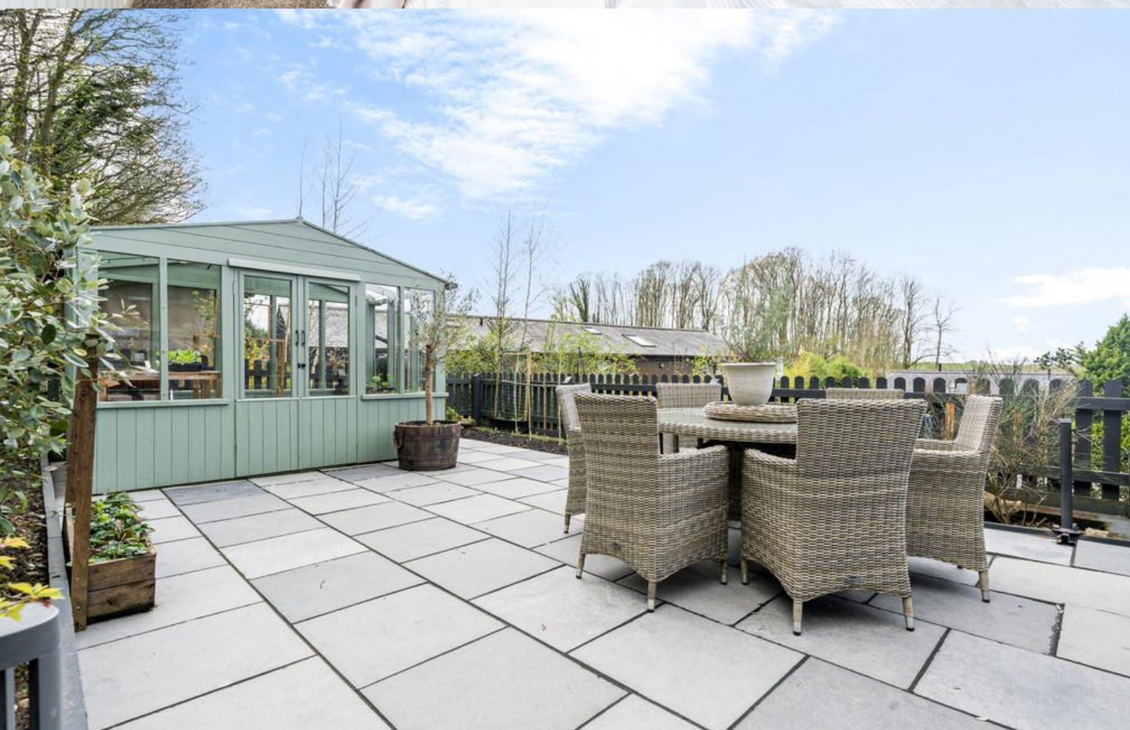
Terrace and Greenhouse