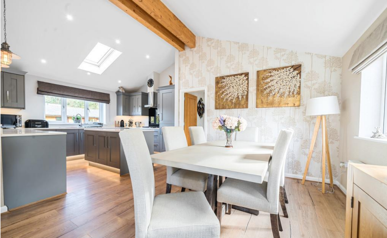
Open plan Living/Dining/Kitchen