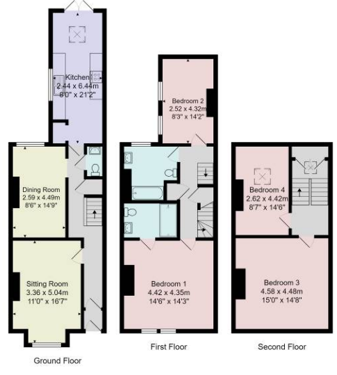
Total Area: 149.0 m² ... 1604 ft² All measurements are approximate and for display purposes only. No liability is accepted by either the agency or Box Property Solutions Ltd as to the exact measurements of the rooms. Box Property Solutions Ltd relating the copyright on this plan and allows agents to use it with agreed permission.