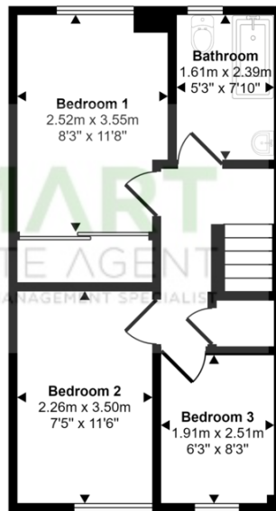
First Floor Approx 35 sq m / 375 sq ft