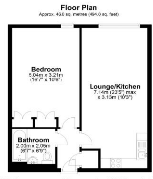
Total area; approx. 46.0 sq. metres (494.8 sq. feet) This floor plan is not to scale and is for illustration/marketing purposes only.

Agents Note: Whilst every care has been taken to prepare these particulars, they are for guidance purposes only. All measurements and charges are approximate for general guidance purposes only and whilst every care has been taken to ensure their accuracy, they should not be relied upon and potential buyers/tenants are advised to recheck the measurements and charges with their acting solicitor.