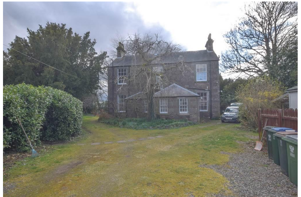
Next Home - The Alders, Hatton Road, Rattray, Perthshire, PH10 7AW