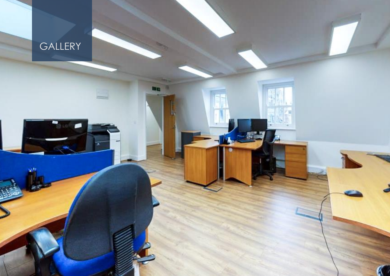
< main office space ▾