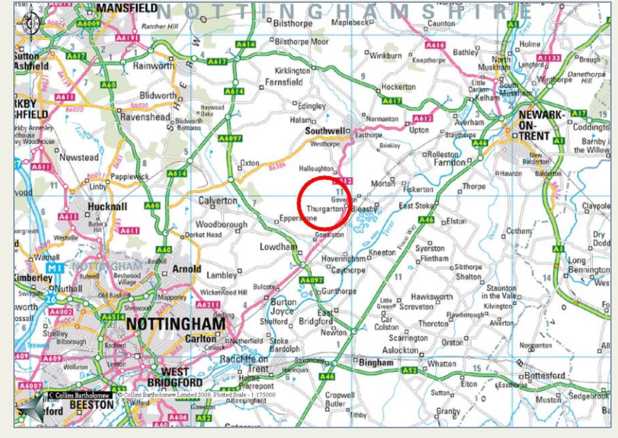
REGIONAL PLAN NOT TO SCALE - FOR IDENTIFICATION PURPOSES ONLY