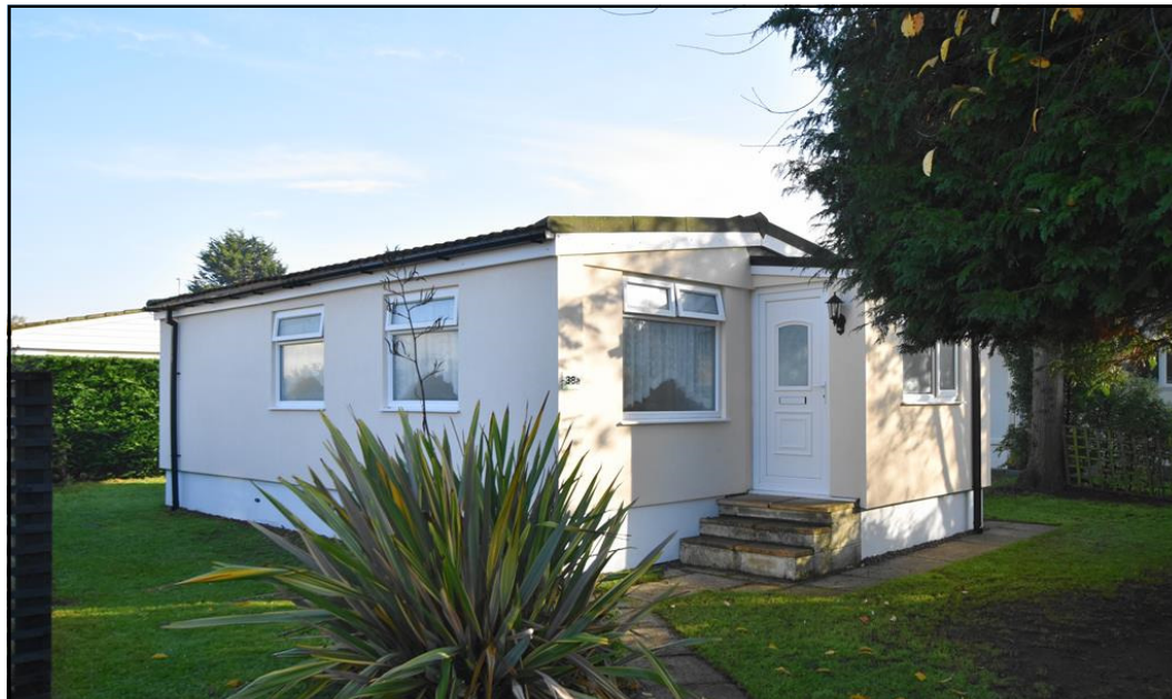
Well Presented Twin Unit Park Home

38a St Leonards Farm Park, Ringwood Road, West Moors, Dorset. BH22 0AG