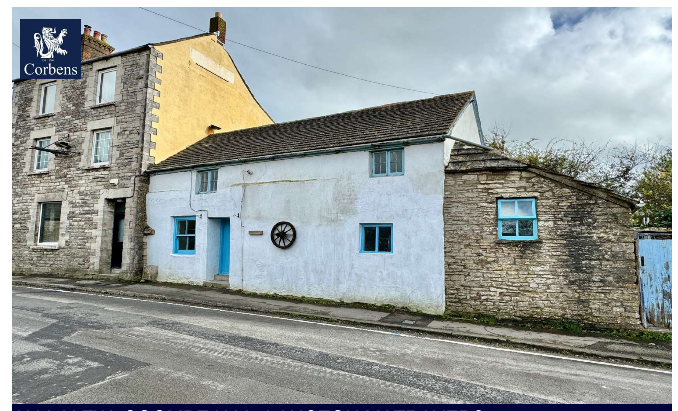
HILL VIEW, COOMBE HILL, LANGTON MATRAVERS £395,000